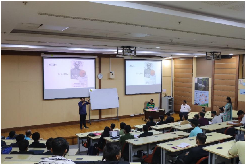
EBSB Quiz: IIM Mumbai Prelims