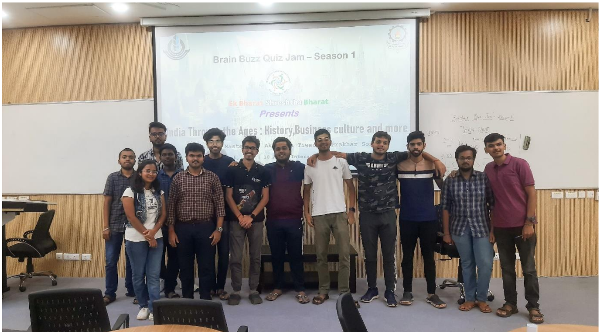
EBSB Quiz Image with IIT Bhubaneshwar Prelims