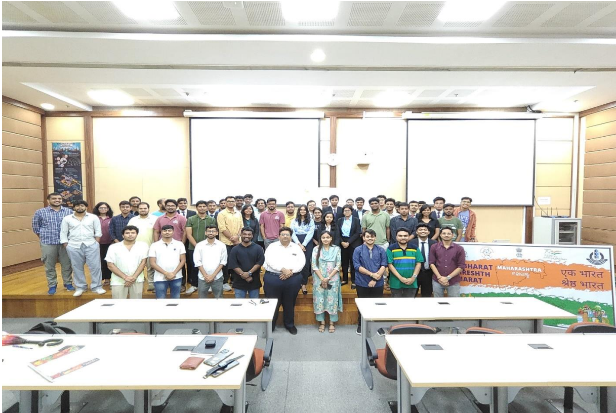
EBSB Quiz Image with IIM Mumbai Prelims